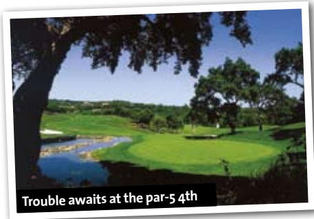
Trouble awaits at the par-5 4th

HOLE 2 345M PAR 4: A drive to the right of the famous cork in the fairway leaves me obscured again. Approach hits a tree and drops down beside a bunker. Semi-shank my chip leaving myself still in rough. Scared, I decide to putt, but don't hit it hard enough and it stays in the fringe. Two more putts to get down. 6