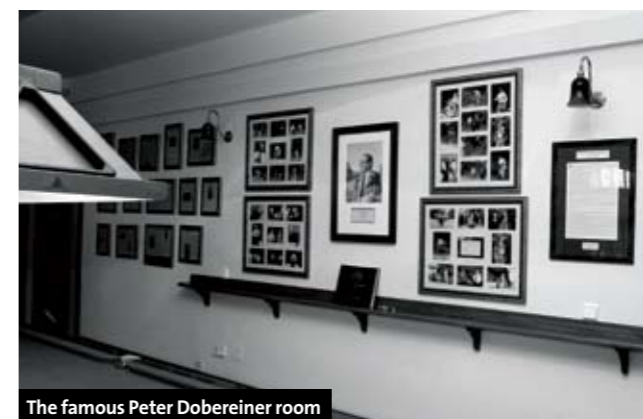
The famous Peter Dobreiner room