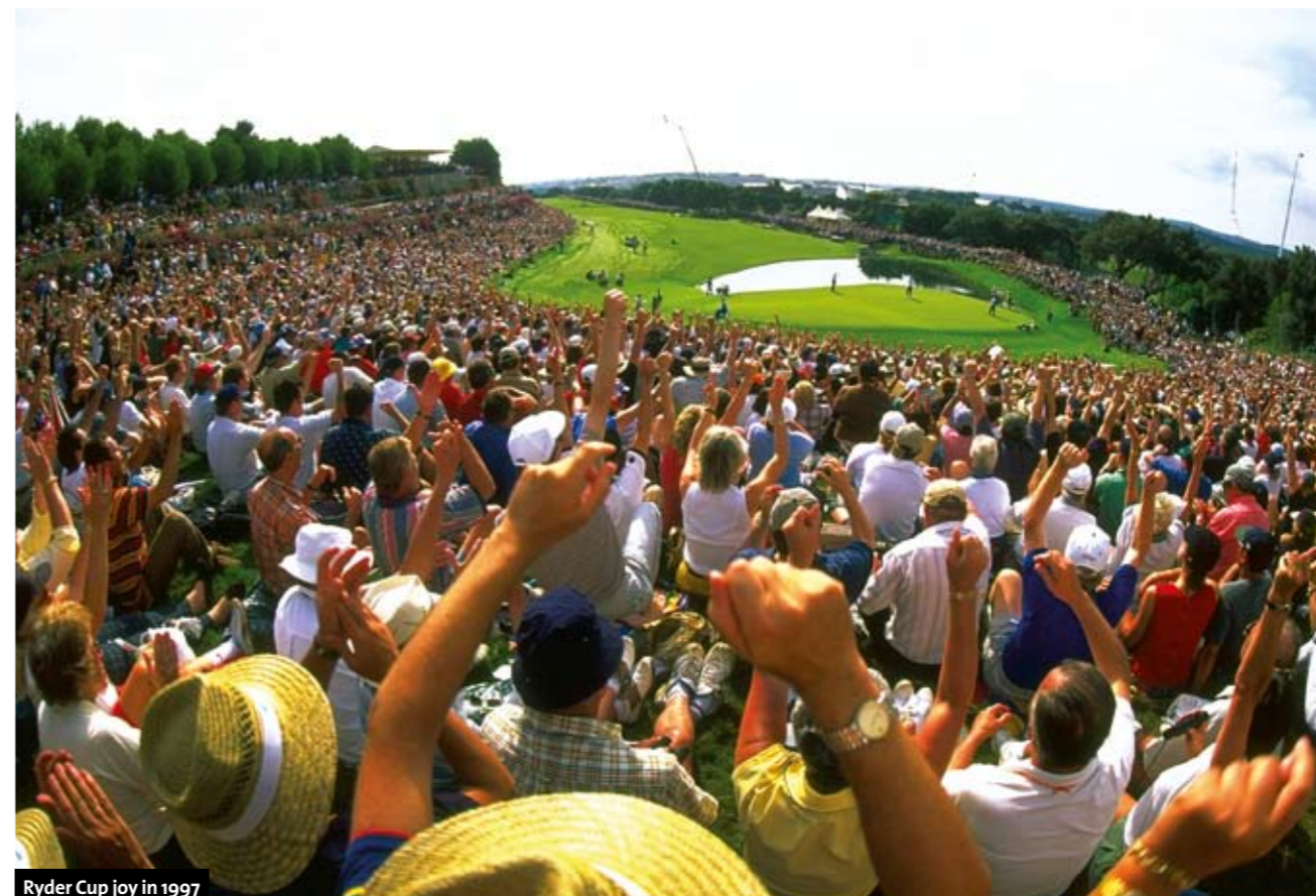
Ryder Cup joy in 1997