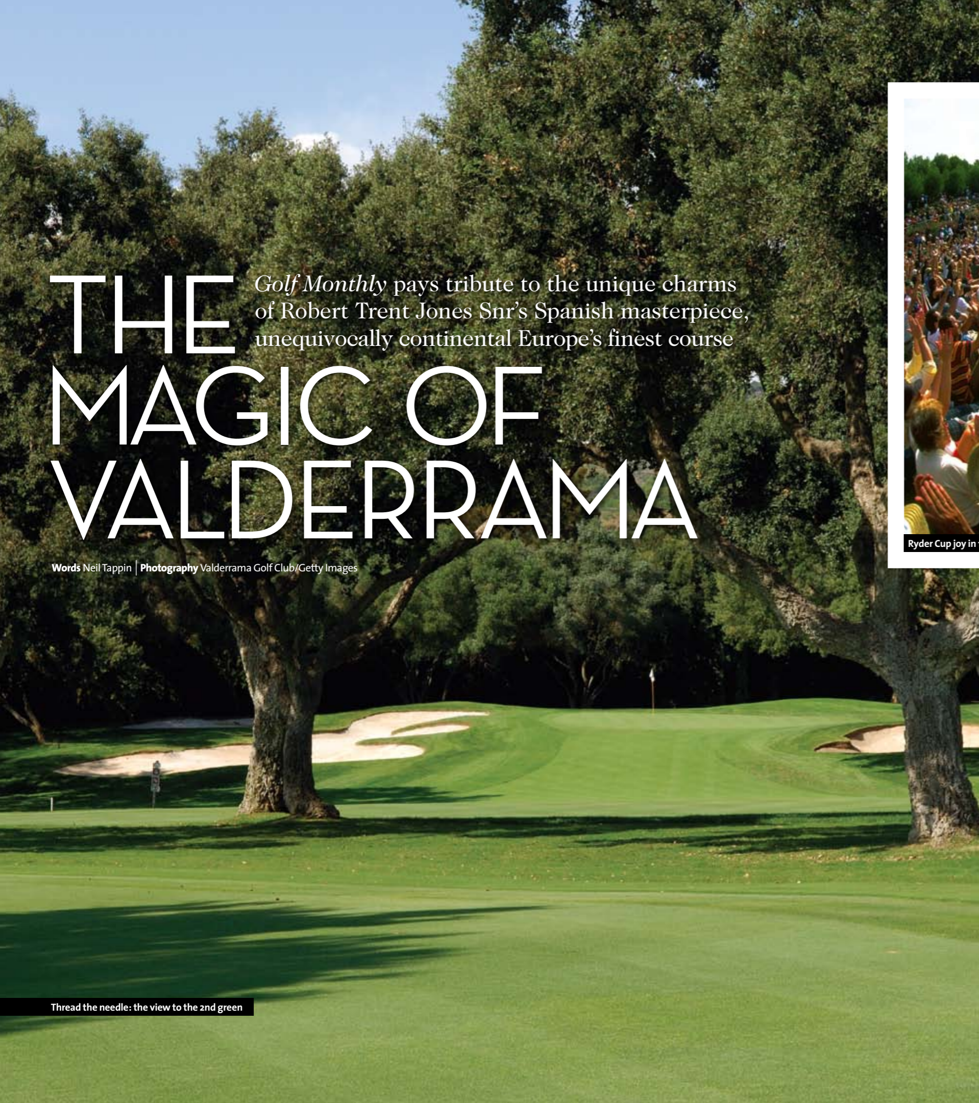
Thread the needle: the view to the 2nd green

Words Neil Tappin | Photography Valderrama Golf Club/Getty Images