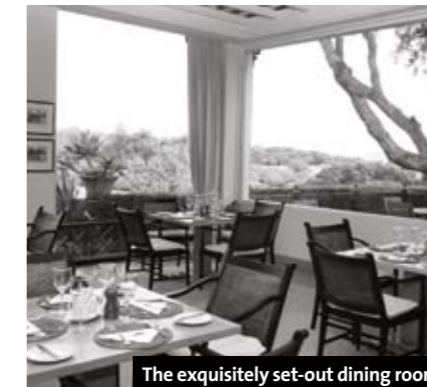
The exquisitely set-out dining room