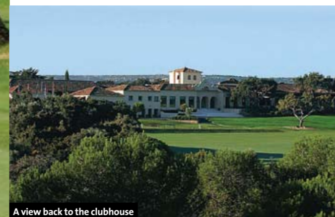
A view back to the clubhouse

I n October 2007, I travelled to Spain for the Volvo Masters; it was my first visit to Valderrama. Unlike the majority of press in attendance that week, I was not there to gather news about the tournament and report back with a blow-by-blow account. Instead, I arrived at 4 o'clock on the Monday afternoon with one simple task: to interview one of the Tour's star players.