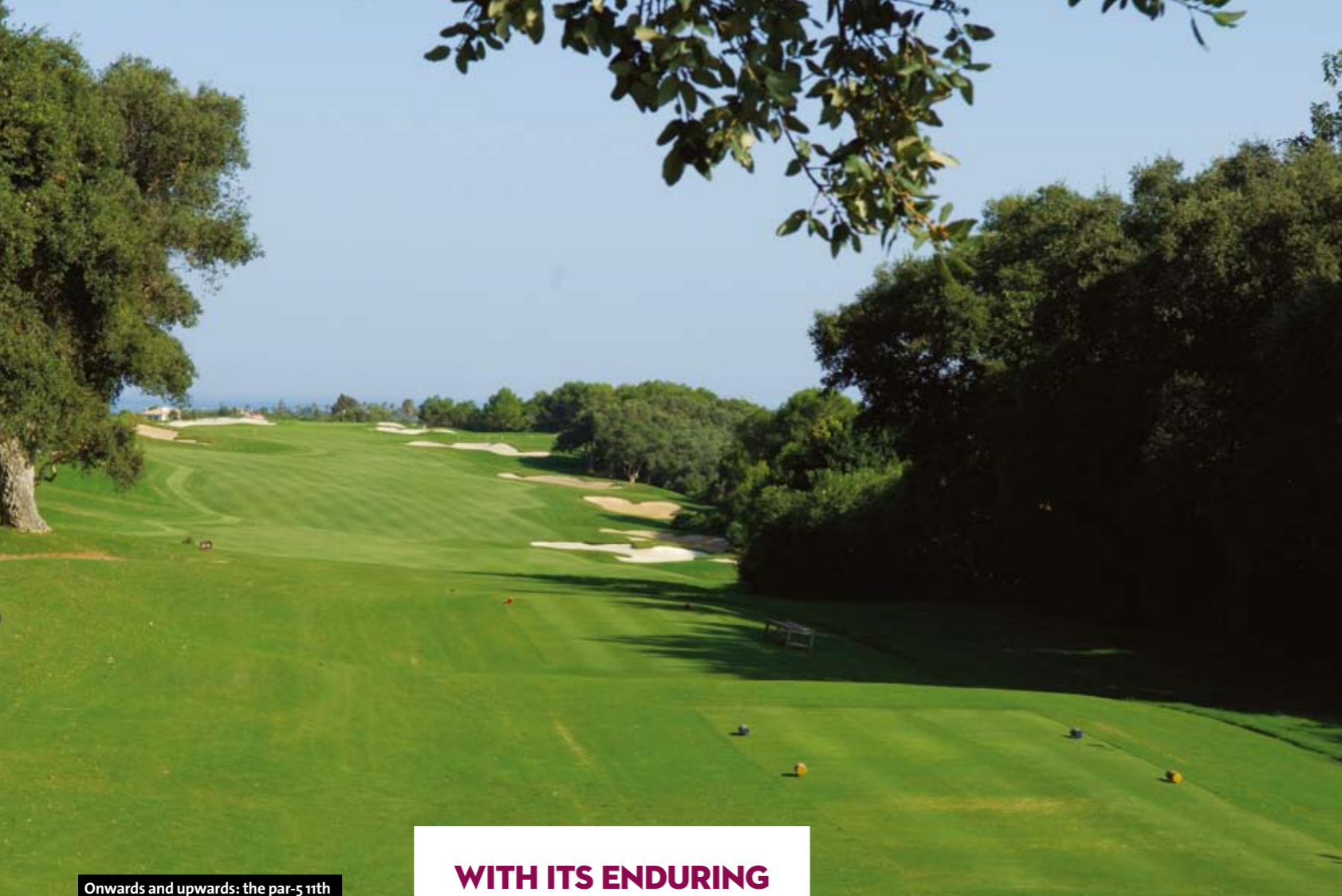
Onwards and upwards: the par-5 11th